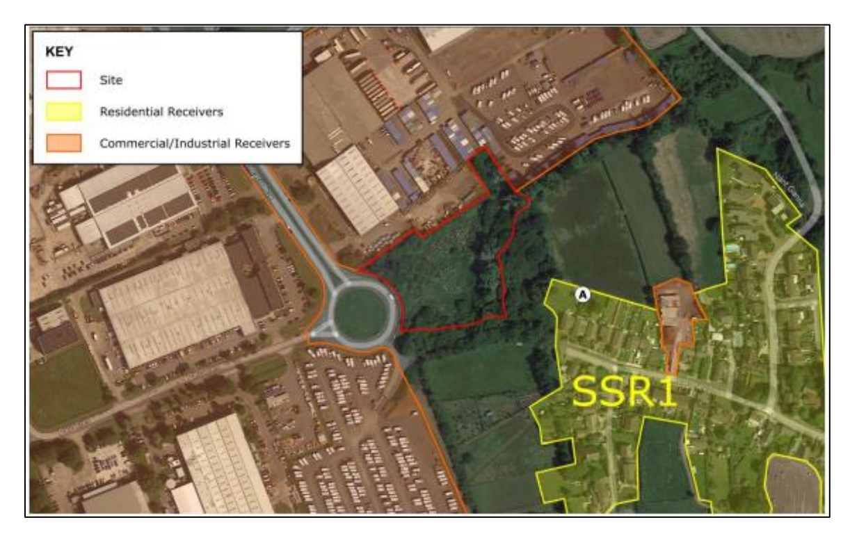
Figure 4 - Site Plan Showing the Nearest Sound Sensitive Receptor and Measurement Location

Predicted noise levels were based on similar activities were undertaken at an existing facility, Nathaniel Car Sales in Bridgend. Additional measurements of a transporter were undertaken at the vehicle delivery site. This also consisted of external measurements of the jet wash stations and valet stations.