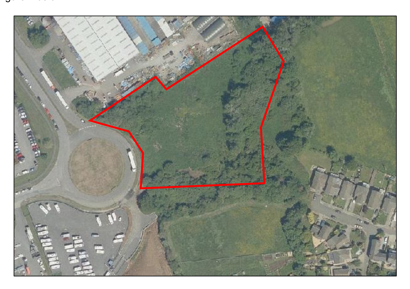
Figure 2 – Site Location Plan

The Application site is situated on Waterton Industrial Estate, but immediately adjacent to the boundary with the Vale of Glamorgan and less than 30m from the curtilage of the nearest residential property in the village of Treoes, which is south-east of the site and separated by an area of broad-leafed woodland. To the north of the site are existing manufacturing and storage operations, whilst the land to the south-west is used for open caravan storage – See Figure 2 below.