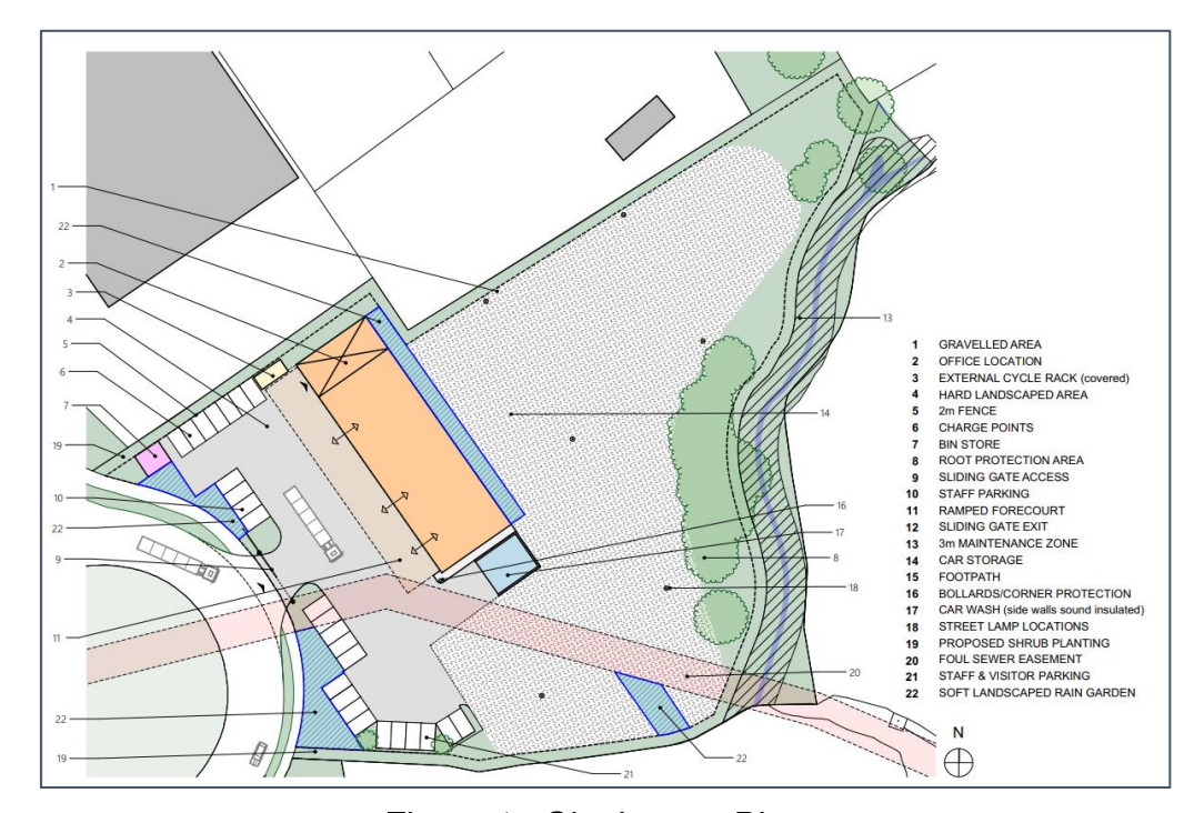
Figure 1 - Site Layout Plan

To the north-west of the building will be an area for the charging of seven vehicles, a cycle store and bin store. A further nineteen car spaces are provided for staff and visitor parking to the south-west of the building. Adjacent to the building will be an enclosed jet car wash facility, which will utilise recycled water. To the east and north-east of the building the regraded land will be laid to gravel to provide secure storage for vehicles. An extract of the revised layout plan is reproduced below: